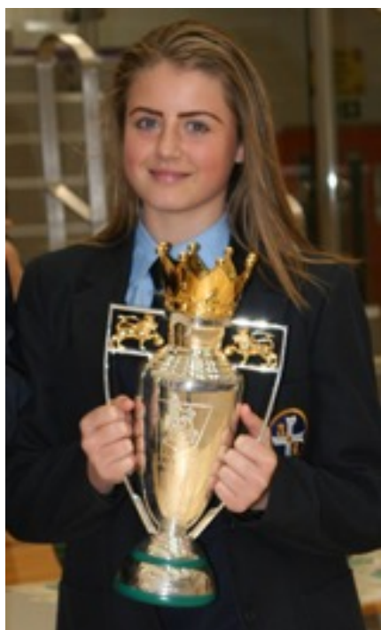
Premier League Champions